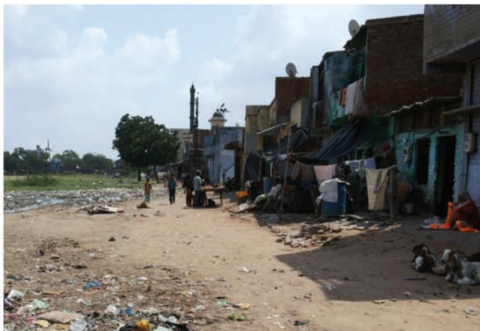
One of the housing societies built by a builder in Bombay Hotel

Several factors have come together to create these unsafe conditions. The state has been largely absent in the locality in terms of planning the built environment and providing infrastructure and services. The rise of some individuals and groups that exert control and power over the other residents of the locality through coercion, threats and direct violence, and the fear that residents experience on a regular basis for their life, family and property are a consequence of this absence of the welfare state as well as the absence of responsive policing. The prevailing social and economic conditions in the locality create a particularly fertile ground for crime and violence to flourish.