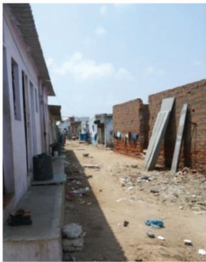
Partially constructed buildings (seen on the right) which are taken up for illicit activities

Lack of streetlights creates opportunities for thefts and burglaries in the locality. While some of the main roads have had streetlights for a few years, the internal roads are pitch dark after sunset. In some societies, local politicians have provided streetlight poles but lights have not been installed as yet. In some societies, residents have light bulbs outside their home but it is not affordable to keep these bulbs on all night.