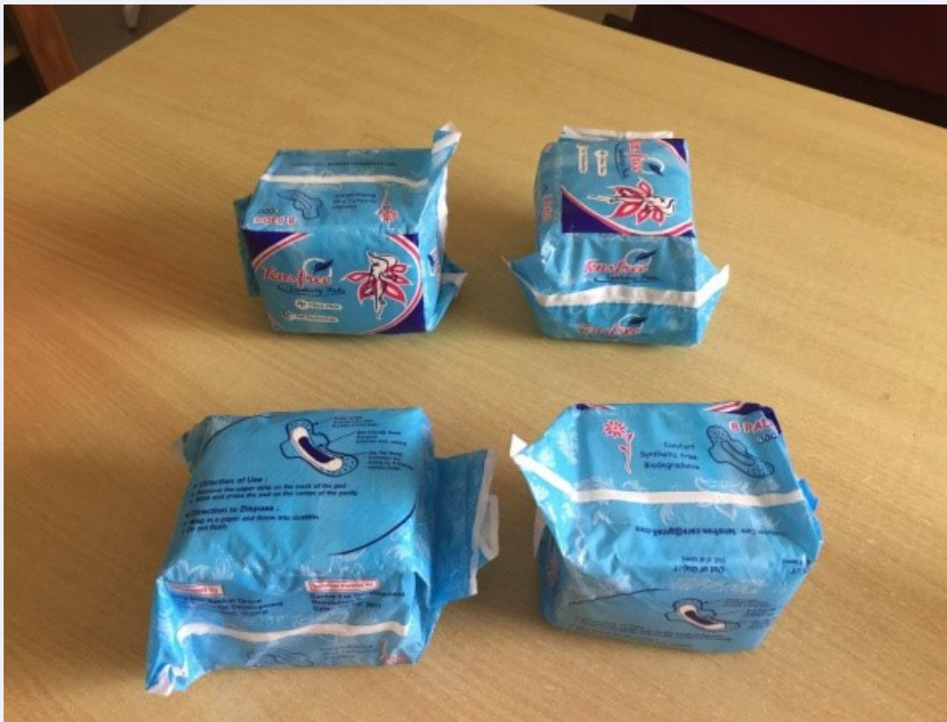
Tense Free – Affordable Biodegradable Sanitary Pads

for her nephew recently. She loves to learn new skills and knowledge from different sources and very open for learning. She has now started working in a residential area as a domestic help, for supporting her family. Tense Free – Affordable Biodegradable Sanitary Pads