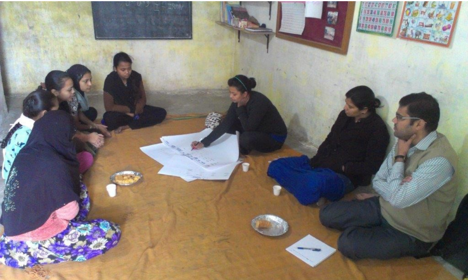
CEPT team at Bombay Hotel for conducting the study

Joint study by CEPT University- CfD on Urban Development- its challenges