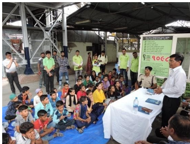
A talk by the Child Welfare Committee member at Kalupur Railway station on Children's day and Awareness campaign by children on Child rights

The days like International Human Rights Day, Child Labour Elimination Day and International Children's Day was celebrated in the area in the presence of the local leaders and committee members for creating awareness about Child Rights, fundamental rights and duties. The children participated in painting, singing and rally to mark the celebration of these days. CfD is the nodal agency for Ahmedabad. CfD has been managing the Child Help Desk at Kalupur Railway Station, Ahmedabad in collaboration with Childline India Foundation since 2016. On 14th June one program was organized at railway station with the support to railway department, RPF, GRPF, Coolies (potter), rickshaw drivers and vendors to generate awareness on child rights and protection