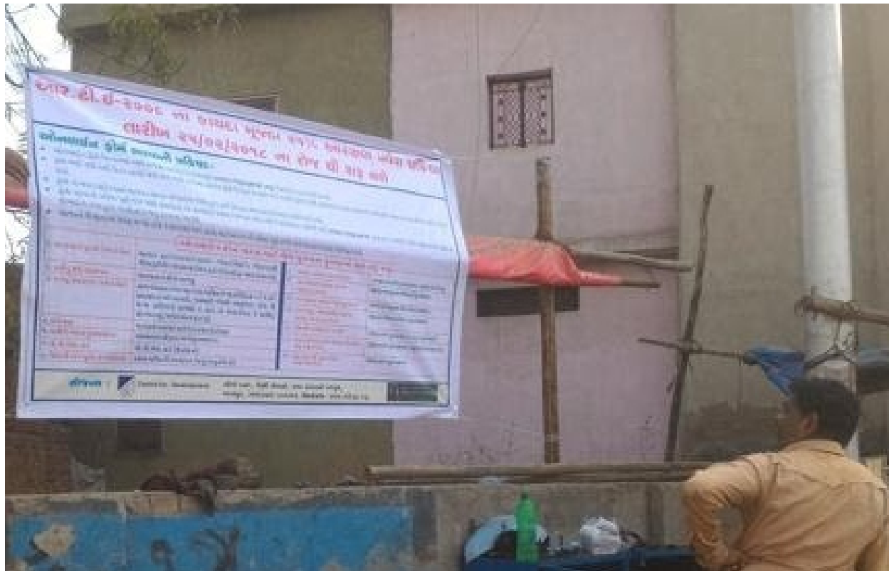
Posters about the facilitation service and the centre

One campaign and area wise meetings were organized to generate awareness about the Right to Education and also facilitate maximum number of urban poor families in filling up the forms under the 25% reservation quota. Every year CfD plans campaigns in the months of March and April, like wise this year also campaign was organised in all the 11 areas as planned. This year there was rush amongst parents during the form filling since the state online application submission was declared very late by the state. As a result the cyber café owners took advantage of the rush and charged Rs. 200- to Rs. 400 per one form. Hence, CfD started 11 such facilitation centres for form filling which