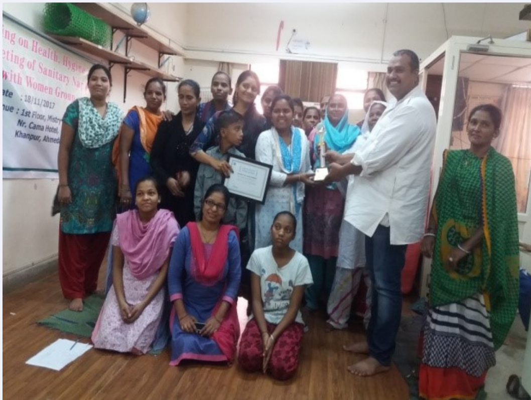
CfD received recognition at IGSSS partners meet

hours a day. They are getting their wages per hour, i.e Rs. 21.25/-. In the past 4 months, 4000 packets with 8 pads have been completed and transported to Assam as the first consignment. At present, they are manufacturing 1000-1200 pads per day. At times the manufacturing process is not smoothly going on due to festive season and CfD received recognition at IGSSS partners meet