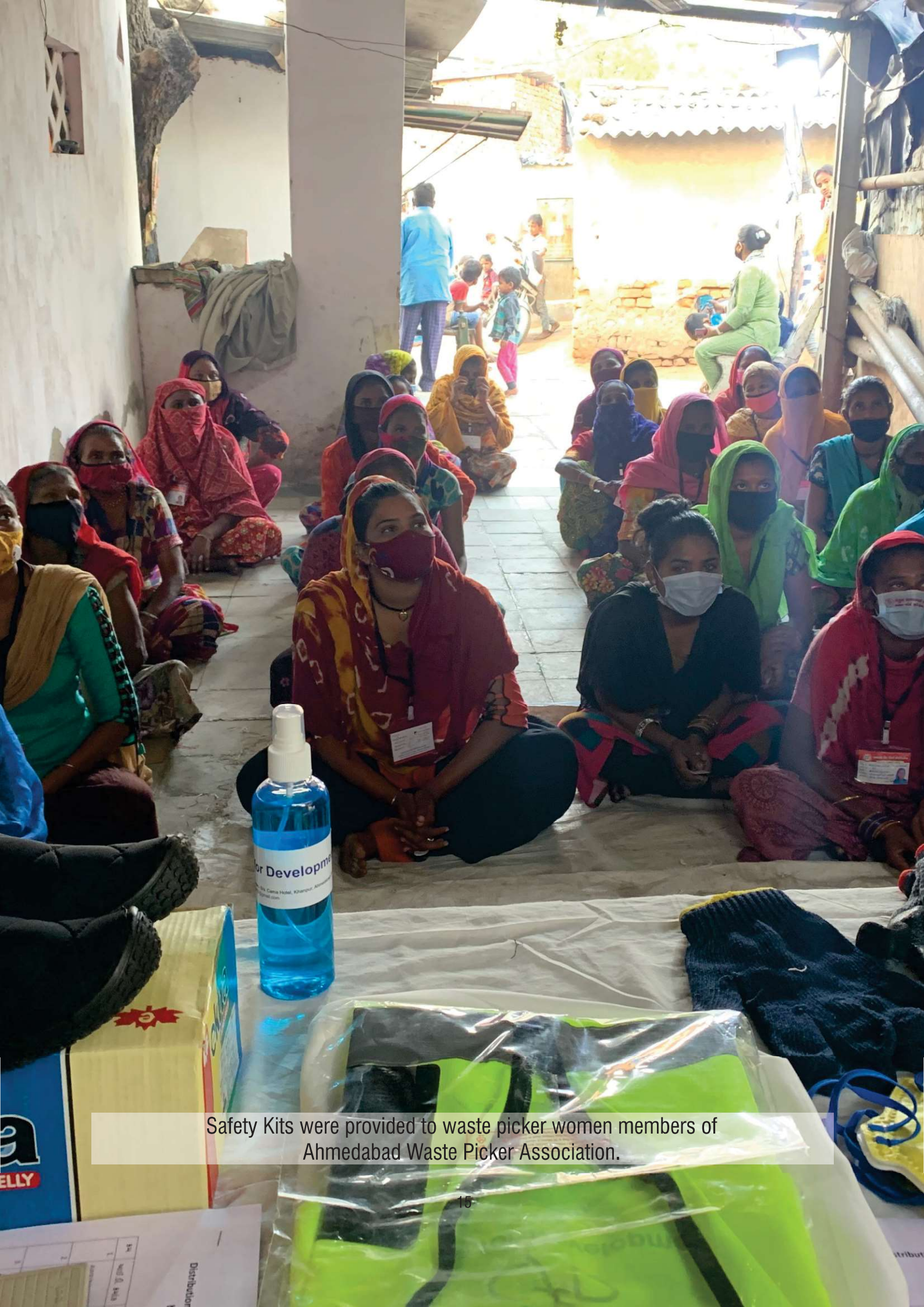
Safety Kits were provided to waste picker women members of Ahmedabad Waste Picker Association.