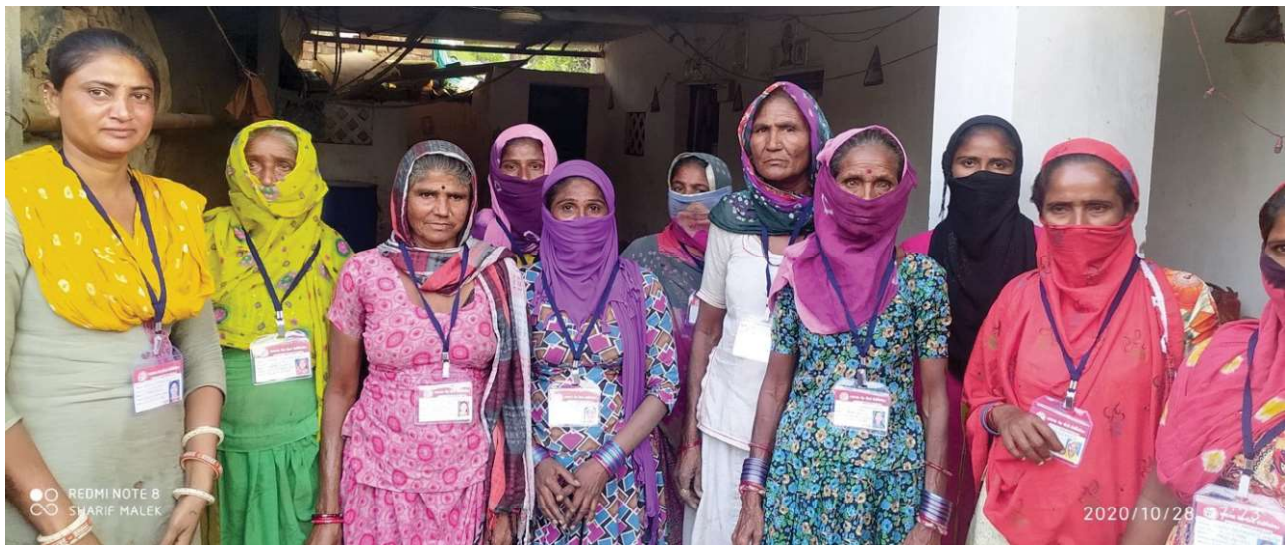
Identity cards as members of Ahmedabad Waste Picker Association were provided to 378 waste picker women.