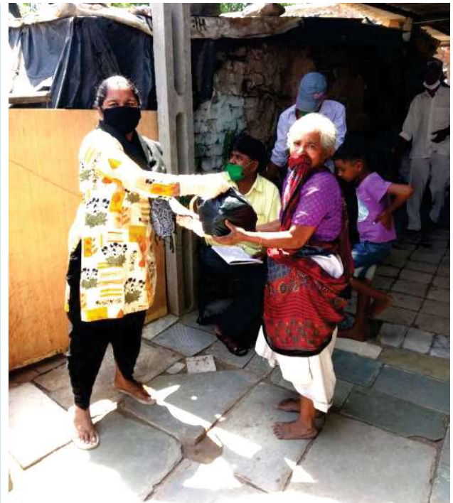
Sanitization kit distribution at Saraniya vas